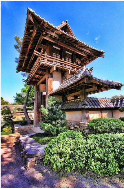
Japanese Gardens Ft. Worth